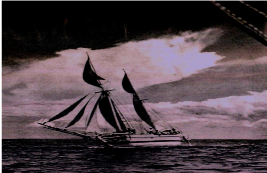
Photo: Bugis-Makassar's Pinisi boat sailing on the sea

Gale 2 ships belonged to Makassar's King, has three prows (or guling in Bugis language), which make this kind of ship more superior than one-prow ships. The three-prow ships have faster acceleration and more agile in face the sea waves. This kind of ships is usually owned by the rich and kings of Bugis and Makassar. In inter-island trading, Makassar Gale ships were considered as the most powerful ship, and therefore used by Bugis-Makassar and Malayan noblemen to transport rempah ratus from Moluccas. It should be noted that Gale ship has improves the maritime trading in Gowa, as well as other ports in South Sulawesi, since sixteenth century.